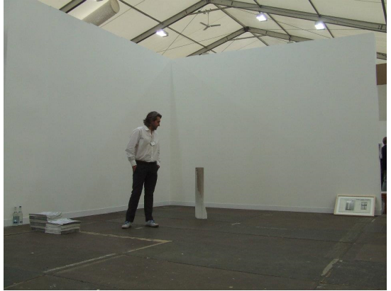
Elena Bajo, The Pervasive Element , Frieze Art Fair, Frame, October 2011